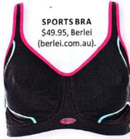
SPORTS BRA $49.95, Berlei (berlei.com.au).