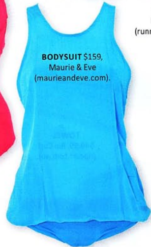
BODYSUIT $159, Maurie & Eve (maurieandeve.com).