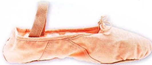
BALLET SHOES $29.95, Energetiks (energetiks.com.au).