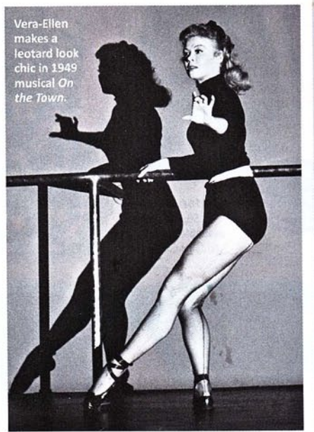
Vera-Ellen makes a leotard look chic in 1949 musical On the Town .

W ith a wide scope of dance classes available, you're spoiled for choice. There's everything from ballet and Zumba, to ballroom and salsa. Most styles build strength by incorporating movements that resist against the dancer's own weight. Expect improved flexibility and endurance – Australian Dancing Society (australian.dancingsociety.com.au) should lead the way.