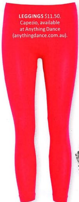
LEGGINGS $11.50, Capezio, available at Anything Dance (anythingdance.com.au).