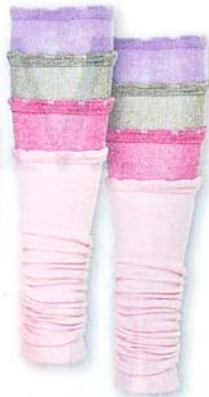
LEG WARMERS $17.95, Anything Dance (anythingdance.com.au).