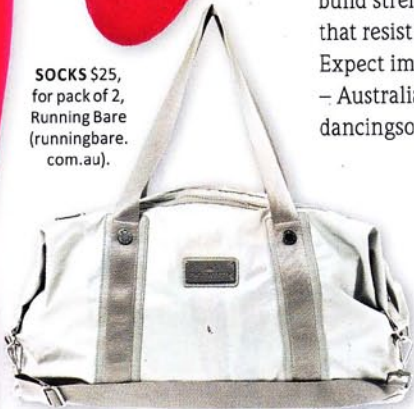
BAG $250, Adidas by Stella McCartney (1800 801 891).