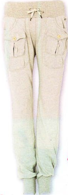
PANTS $159, Ra-Re (07 5591 7233).