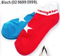
SOCKS $25, for pack of 2, Running Bare (runningbare.com.au).