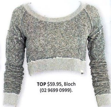
TOP $59.95, Bloch (02 9699 0999).