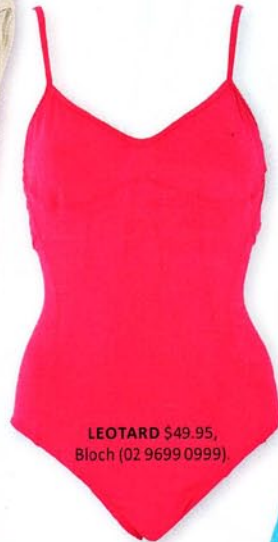
LEOTARD $49.95, Bloch (02 9699 0999).