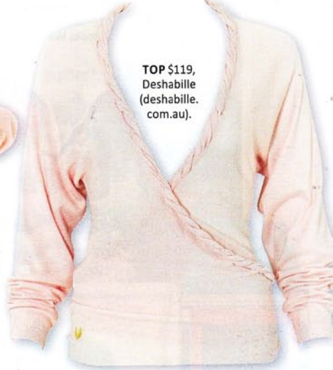
TOP $119, Deshabille (deshabille.com.au).