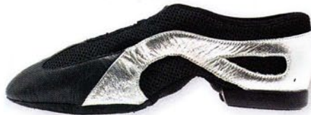
SHOES $125, Bloch (02 9699 0999).