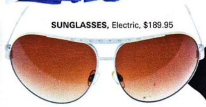
SUNGLASSES, Electric, $189.95