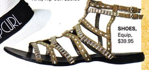
SHOES, Equip, $39.95