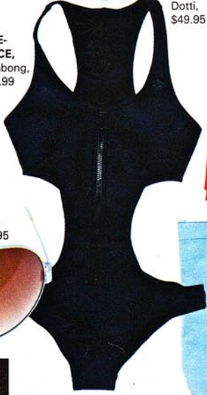
ONE-PIECE, Billabong, $99.99