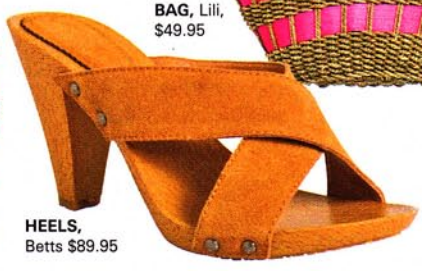
HEELS, Betts $89.95