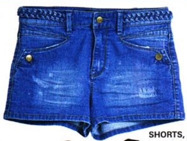
SHORTS, Dotti, $49.95