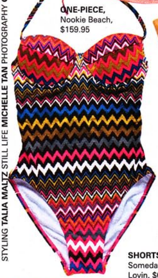
ONE-PIECE, Nookie Beach, $159.95