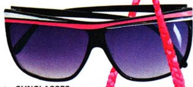
SUNGLASSES, Equip, $21.99