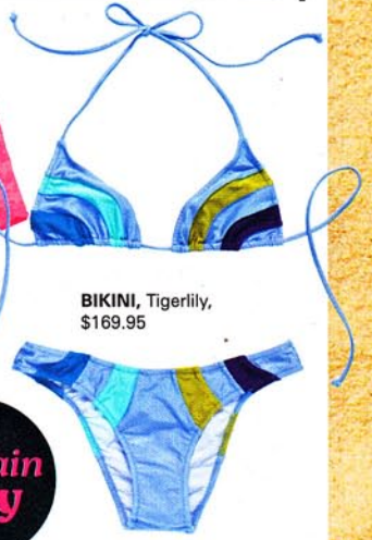
BIKINI, Tigerlily, $169.95