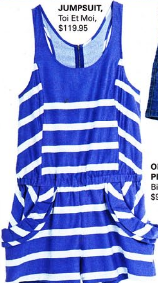
JUMPSUIT, Toi Et Moi, $119.95