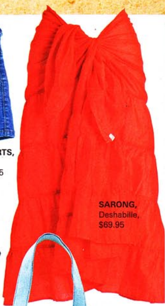
SARONG, Deshabille, $69.95