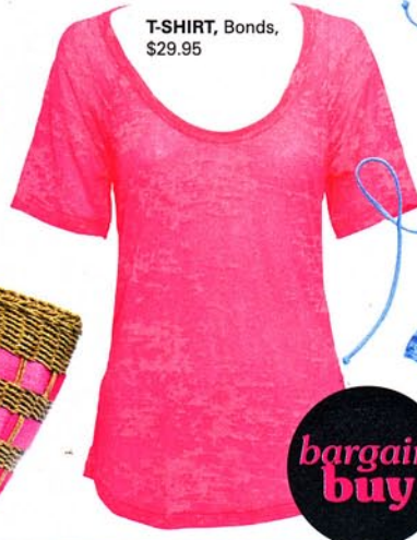
T-SHIRT, Bonds, $29.95