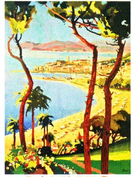
ÉTÉ CANNES HIVER CÔTE D'AZUR