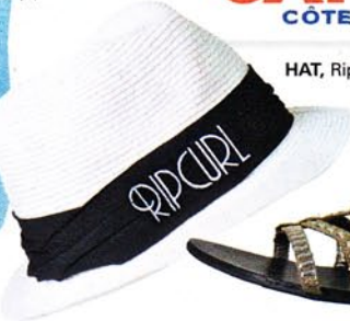
HAT, Rip Curl $25.99