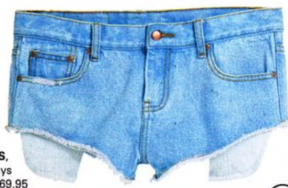
SHORTS, Somedays Lovin, $69.95