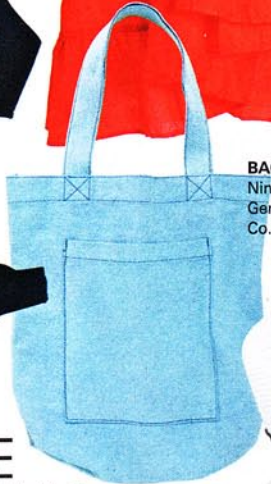
BAG, Agent Ninety Nine @ General Pants Co., $19.95