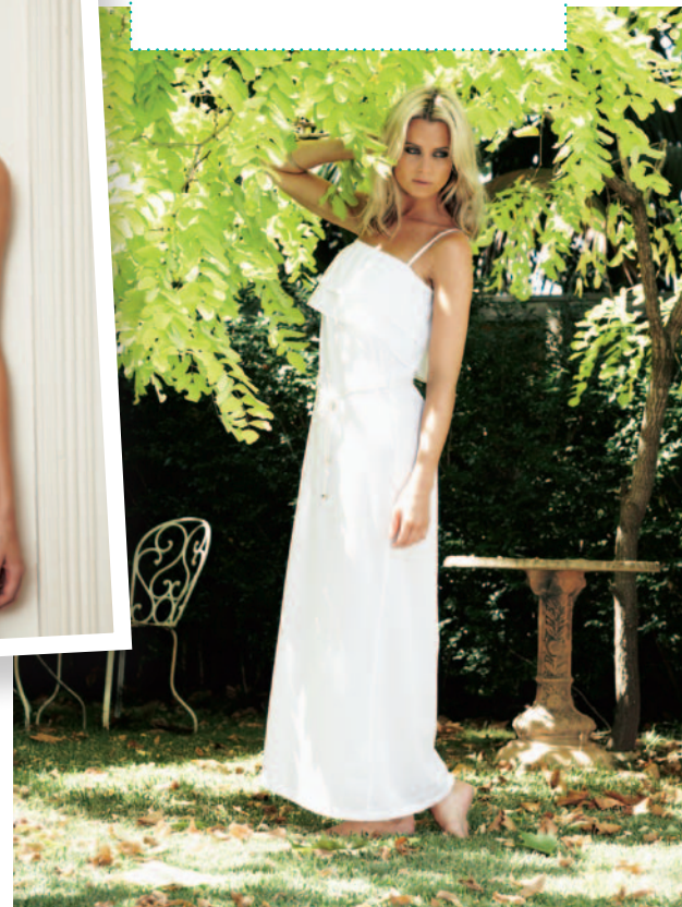
Capture the mood of the 70s in a feather-light cotton beach dress. Long Island Beach Dress RRP$69.95 from Deshabille www.deshabille.com.au