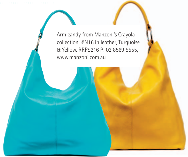
Arm candy from Manzoni's Crayola collection. #N16 in leather, Turquoise & Yellow. RRP$216 P: 02 8569 5555, www.manzoni.com.au