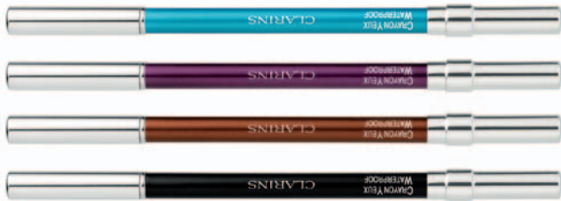
Eye colours that you can take for a dip in the resort pool - very cool. A creamy easy-blend formula which stays put and luminous colours (we love Turquoise) make for an instant summer hit. Clarins Colourfizz Waterproof Eye Pencils RRP$36 from department stores and online at adorebeauty.com.au