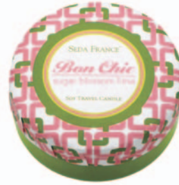
Très bon! A gorgeous travel candle with a French accent. Bon Chic soy travel candle from Seda France available in Sugar Blossom Lime, White Cashmere Blossom and Orange Flower Sumatra. RRP$24.95 each, from Saison. P: 03 9078 3747, www.saison.com.au