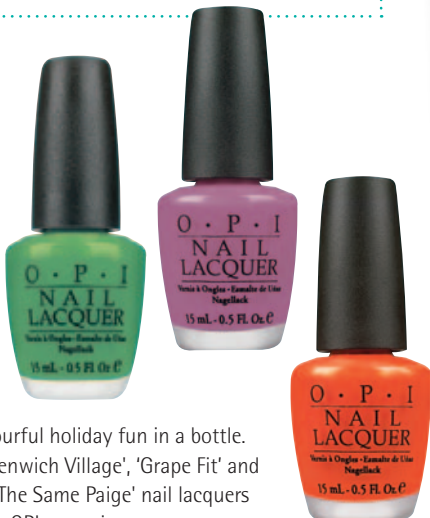
Colourful holiday fun in a bottle. 'Greenwich Village', 'Grape Fit' and 'On The Same Paige' nail lacquers from OPI www.opi.com.au