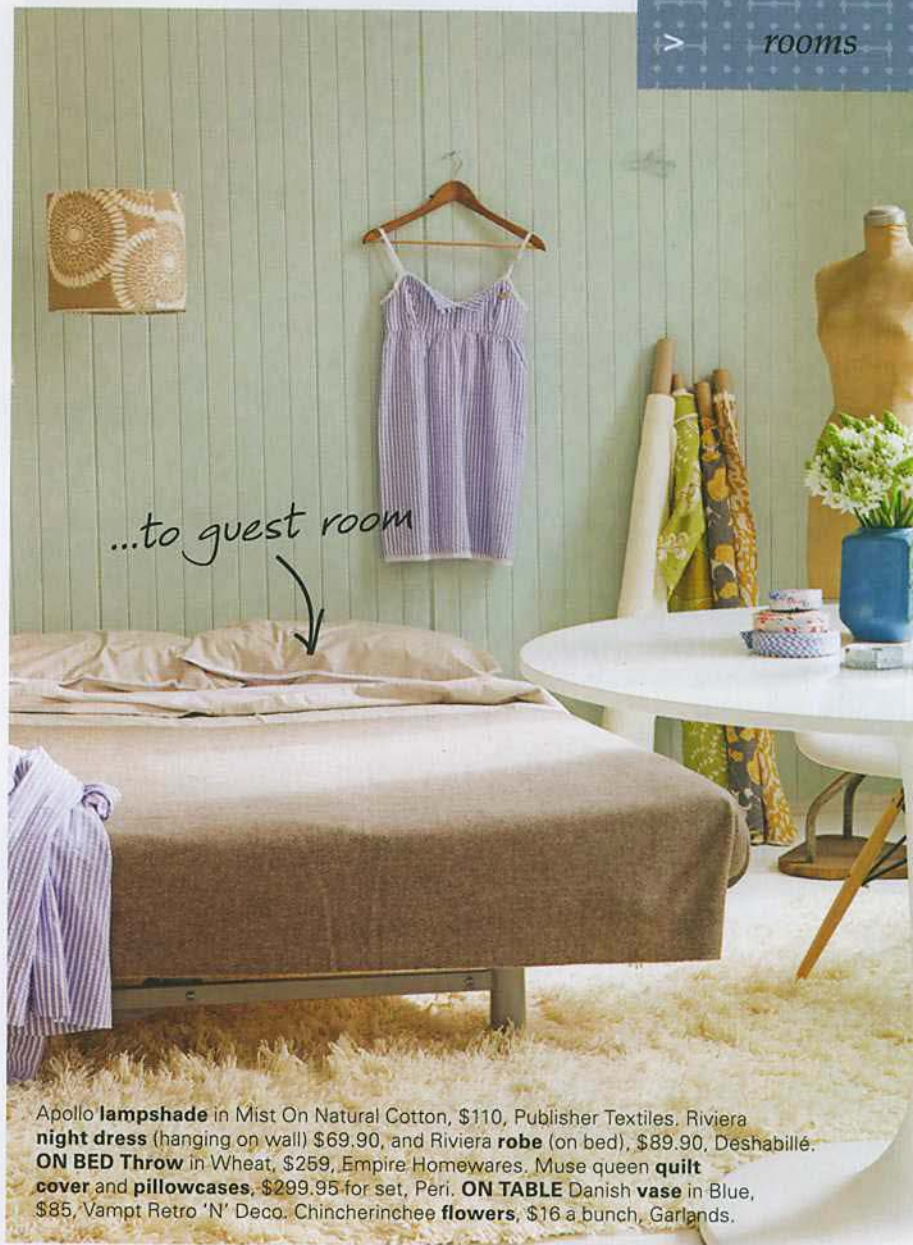
Apollo lampshade in Mist On Natural Cotton, $110, Publisher Textiles. Riviera night dress (hanging on wall) $69.90, and Riviera robe (on bed), $89.90, Deshabillé. ON BED Throw in Wheat, $259, Empire Homewares. Muse queen quilt cover and pillowcases , $299.95 for set, Peri. ON TABLE Danish vase in Blue, $85, Vampt Retro 'N' Deco. Chinchinchee flowers , $16 a bunch, Garlands.

It's holiday season, which means it's time to clean up your workroom and make it look inviting for any friends and rels who are coming to stay. Sweet dreams If, like in this sewing room, you've already invested in a sofa bed, your work is practically done – simply unfold and make! Another great option for small spaces is the inflatable mattress. Modern ones have electric pumps, and you can even get inflatable double or queen ensembles like the ones by AeroBed (aerobed.com.au) and Intex – they're sooo comfy and pack up into a carry bag. These ensemble inflatables also don't mean a lot of bending – perfect for elderly guests. Instant wardrobe In this sewing room, the mannequins are a readymade wardrobe, but if your workroom is packed with shelves and desks, try clearing a shelf and adding