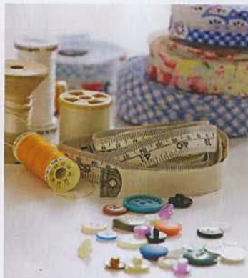
ABOVE Sewing accessories from Lincraft and Spotlight.